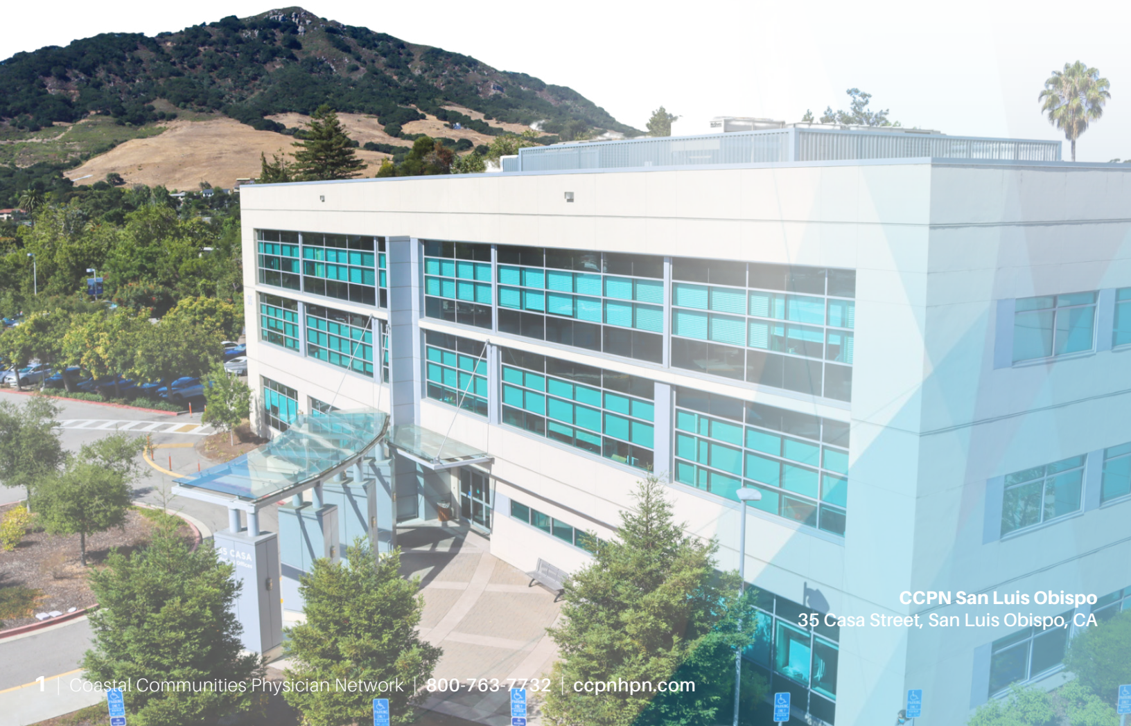
CCPN San Luis Obispo 35 Casa Street, San Luis Obispo, CA

575 Price Street, Ste. 313 Pismo Beach, CA 93449 (805) 556-6011 M-F 8 a.m. - 5 p.m.