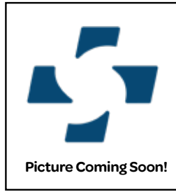
Olfa Najar, MD (f) Internal Medicine Templeton - 265 Posada LS: Arabic, French